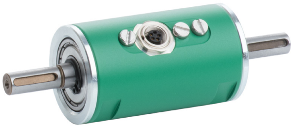
Model 8645 with round shaft