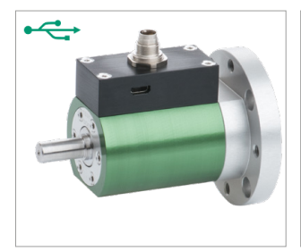
8625 with flange